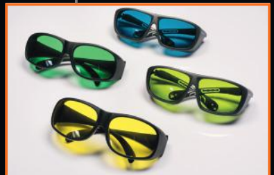
SAFE FOR DOCTOR AND PATIENT