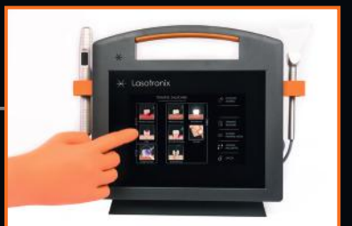
EVERYTHING AT A GLANCE