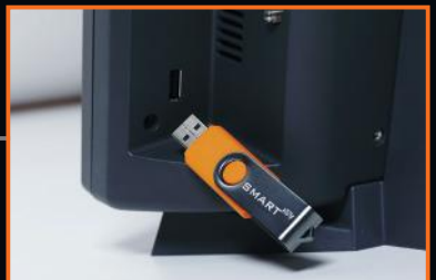
DATABASE, MANUAL AND SAFETY KEY IN ONE