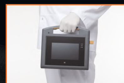
FUNCTIONALITY AND COMFORT